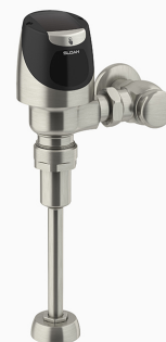
Variation Not Shown: Brushed Stainless