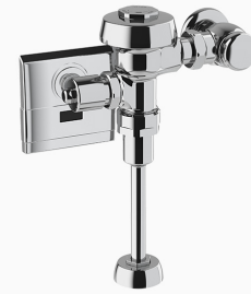
Variation Not Shown: Solid Ring Pipe Support