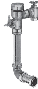
Variation Not Shown: Metal Button Fixture Wall Actuator