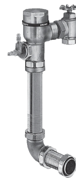
Variation Not Shown: Metal Button Fixture Wall Actuator