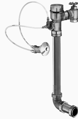
Variation Not Shown: Metal Button Fixture Wall Actuator