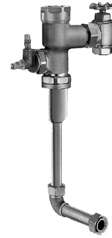
Variation Not Shown: Metal Button Fixture Wall Actuator