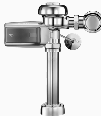
Variation not shown: Trap Primer