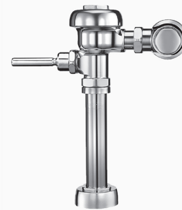
Variation Not Shown: Trap Primer