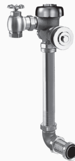
Variation Not Shown: Anti-Flood Device