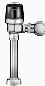
Variation Not Shown: Trap Primer