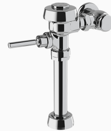
Variation Not Shown: Front of Valve Handle