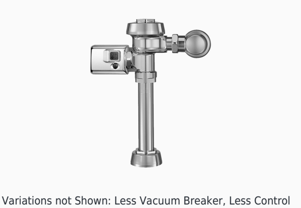
Variations not Shown: Less Vacuum Breaker, Less Contro Stop