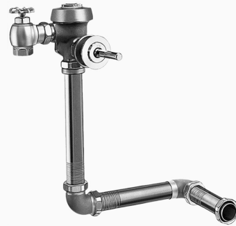
Variation Not Shown: 3" Metal Oscillating Push Button