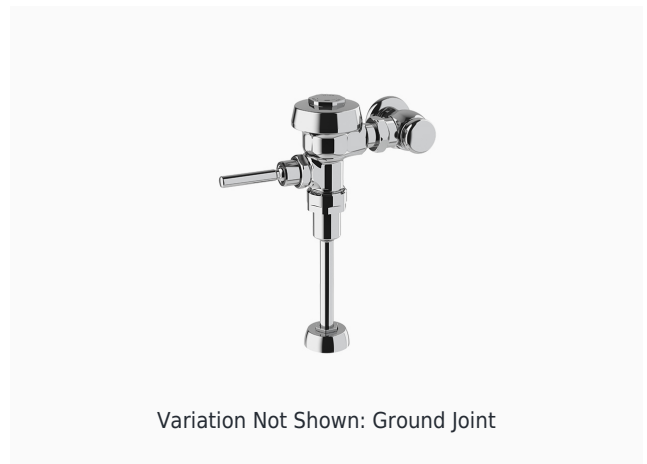
Variation Not Shown: Ground Joint