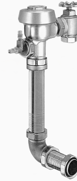
Variation Not Shown: Anti-Flood Device