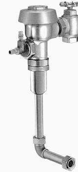
Variation Not Found: Metal Button Fixture Wall Actuator