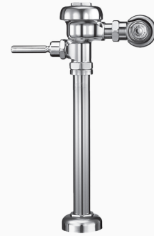
Variation Not Shown: Trap Primer