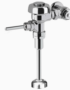
Variation Not Shown: Front of Valve Handle