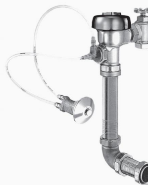
Variation Not Shown: Metal Button Fixture Wall Actuator