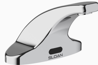
Image for a standard SF-2300 shown

Sloan® Hardwired-Powered Deck-Mounted Mid Integrated Base Body Faucet