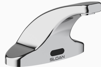
Image for a standard SF-2350 shown

Sloan® Battery-Powered Deck-Mounted Mid Integrated Base Body Faucet