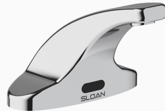
Image for a standard SF-2350 shown

Sloan® Battery-Powered Deck-Mounted Mid Integrated Base Body Faucet