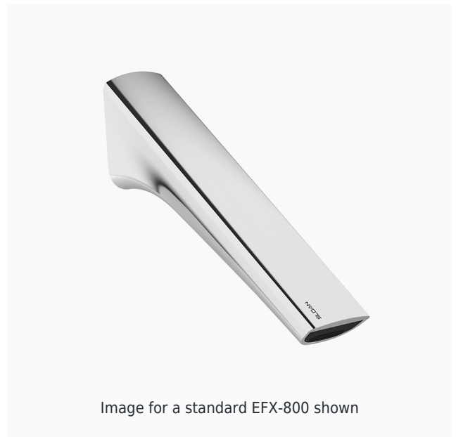
Image for a standard EFX-800 shown