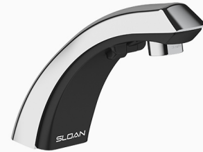
Image for a standard EBF-85 shown