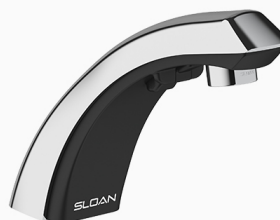
Image for a standard EBF-85 shown

Optima® Battery or Turbine-Powered Deck-Mounted Mid Body Faucet