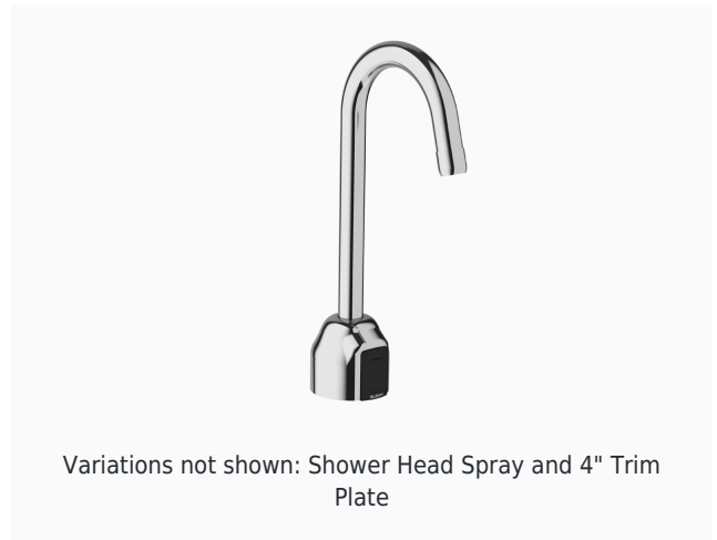
Variations not shown: Shower Head Spray and 4" Trim Plate